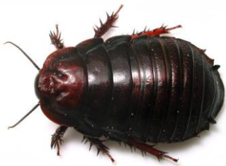
Giant Burrowing Cockroach