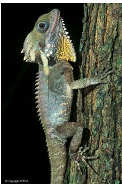
Boyd's Forest Dragon