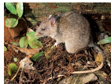
Giant White-tailed Rat